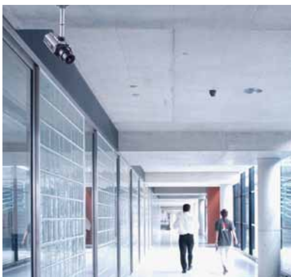
24/7 situational awareness with intelligent video surveillance.