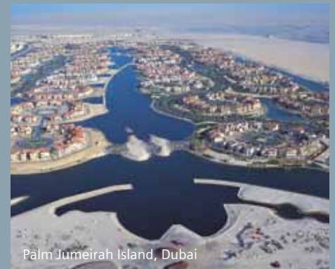
Palm Jumeirah Island, Dubai