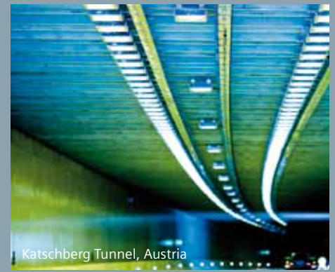
Katschberg Tunnel, Austria