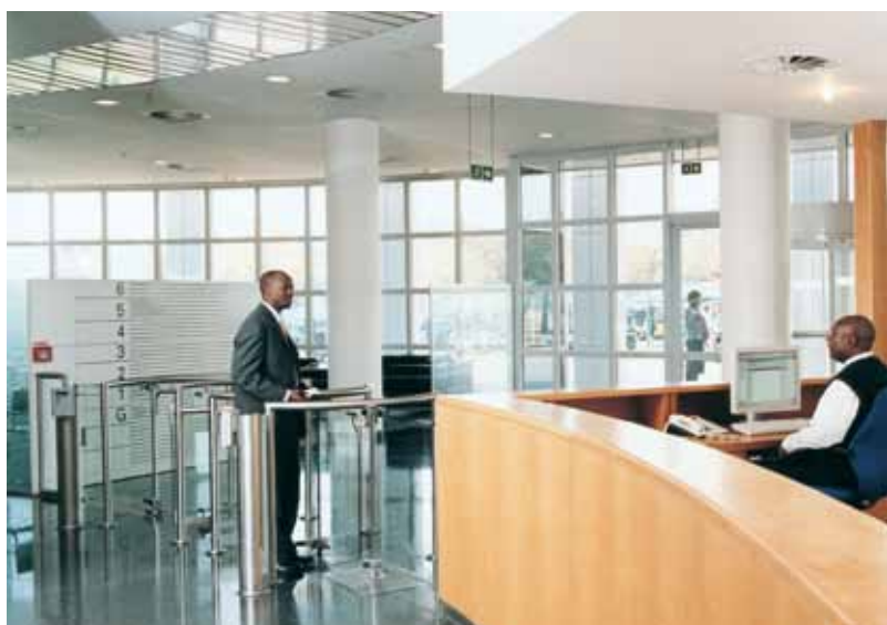
Accessibility meets security with intelligent access control.