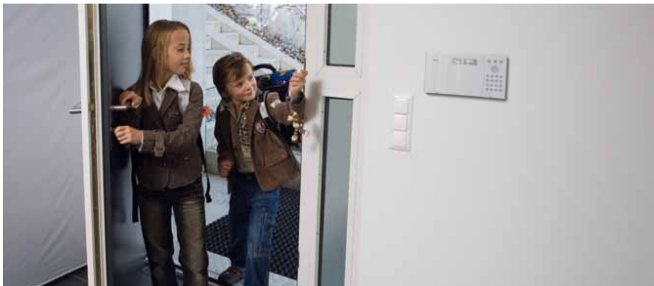
Wherever you are, you are protected with innovative intrusion detection solutions.