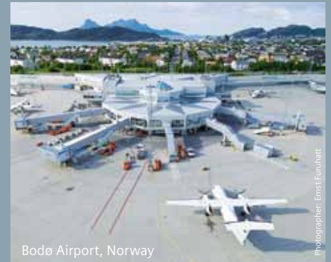
Bodø Airport, Norway