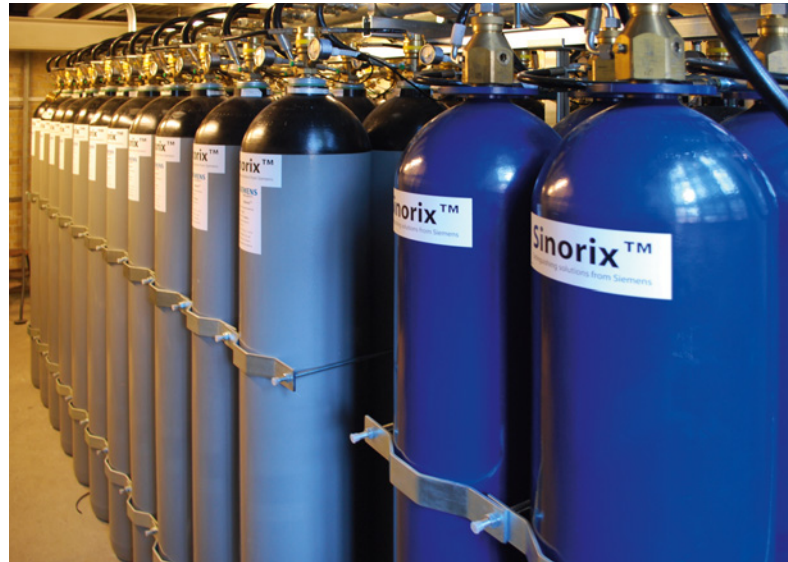
Ideal solutions for comprehensive fire safety: reliable fire detection with Sinteso and efficient extinguishing with Sinorix.