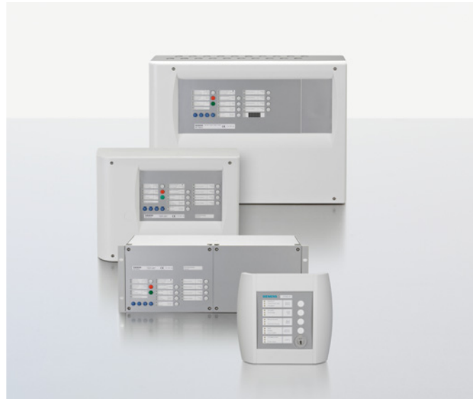
XC10 control panels combine fire detection and extinguishing control and are an ideal solution for room protection, for example of IT rooms.