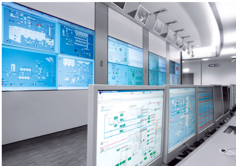
In areas with sensitive technical equipment, Sinorix 227 extinguishing systems extinguish fires without impact on the valuable electronic and electrical systems.