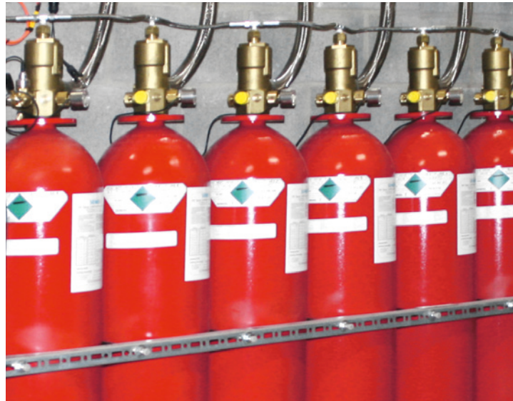
Sinorix 227 provides fast, efficient extinguishing without residues.